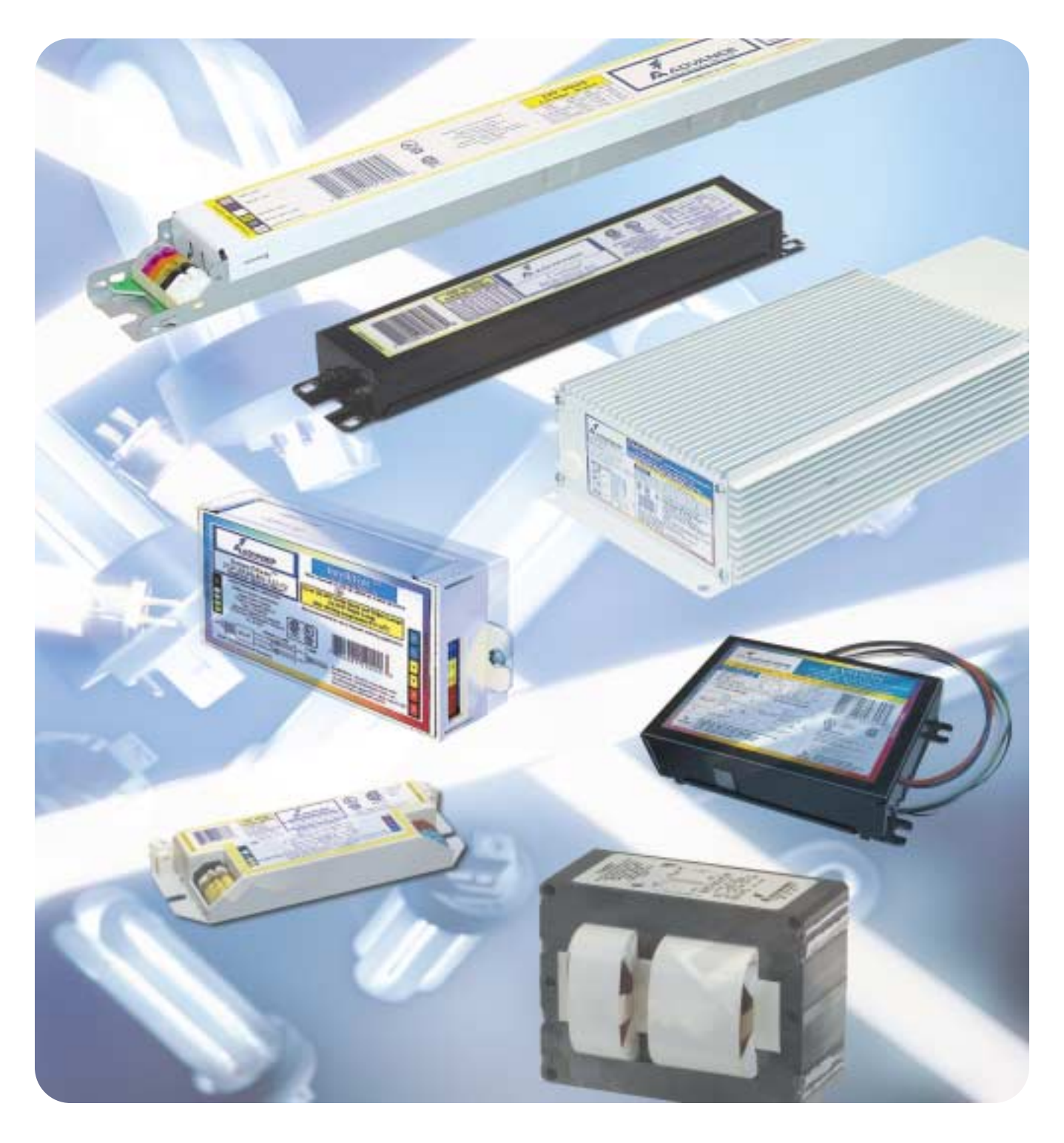
System Powered by Advance